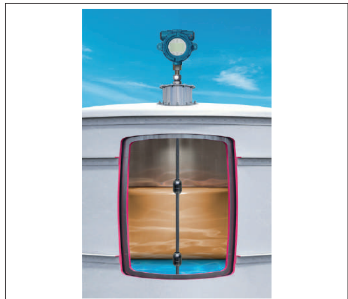
Fig. 2: Example of product and interface level measurement